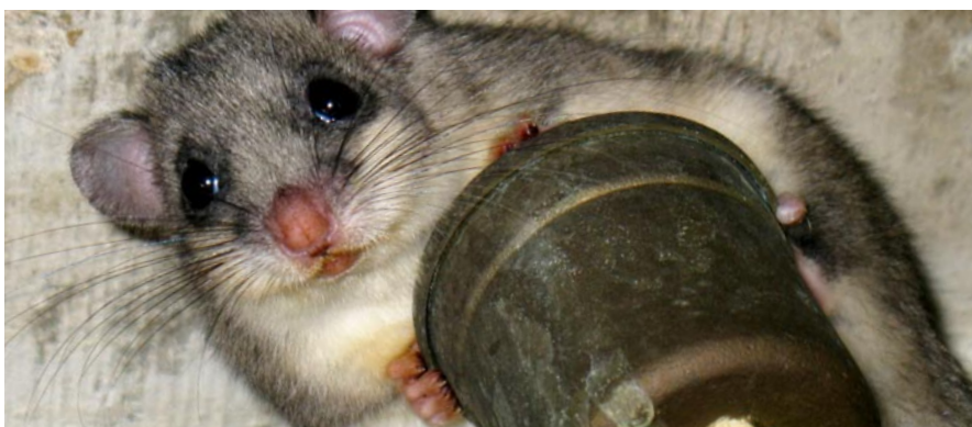
An Edible Dormouse changes a DC insulator pot.